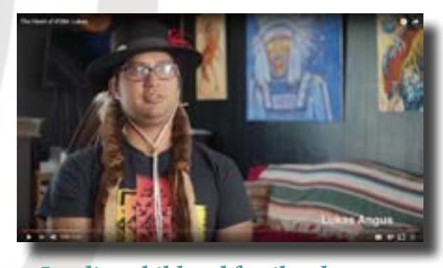
Leading child and family advocacy organizations call ICWA the "gold standard" in child welfare policy and practice because it keeps children with their relatives whenever possible.