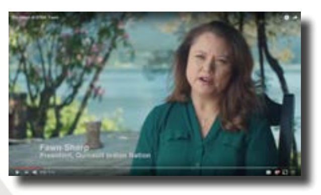
Native families love our children deeply and want them to grow up happy, safe, and surrounded by love.