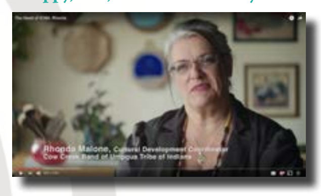
ICWA is not an antiquated law. ICWA is very much needed today to help vulnerable Native children and disempowered Native families.