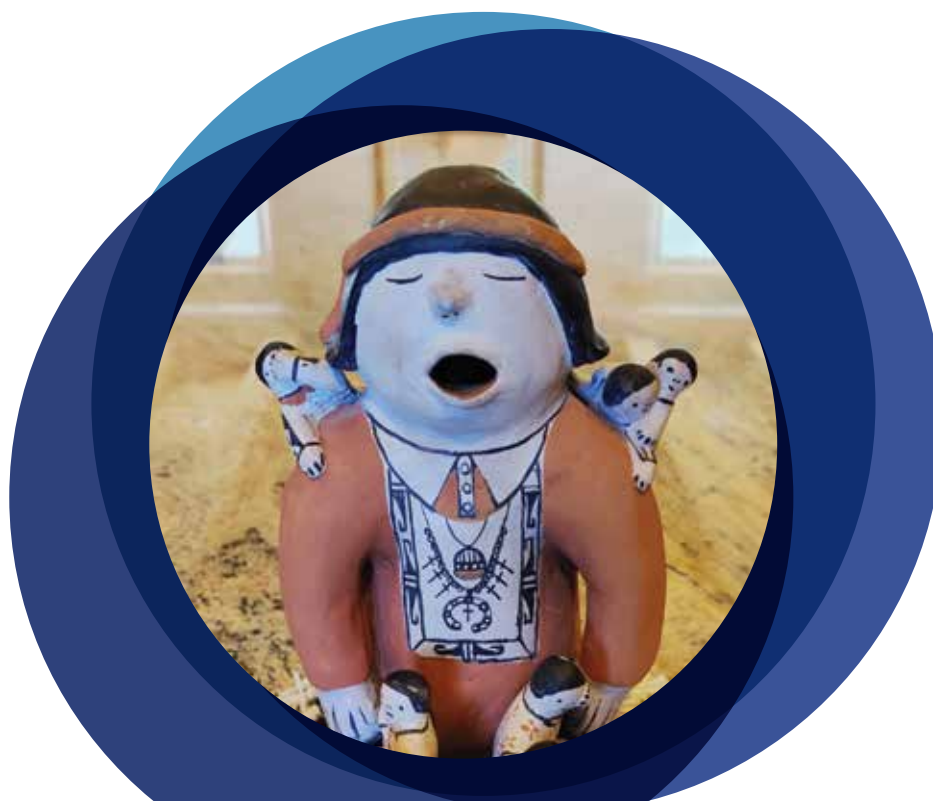
Pottery figure of the legend of the Story Teller, also called Singing Mother.