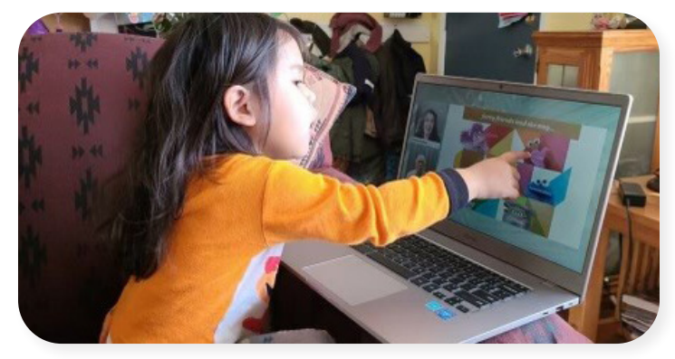
Lavender watching Sesame Street at general session