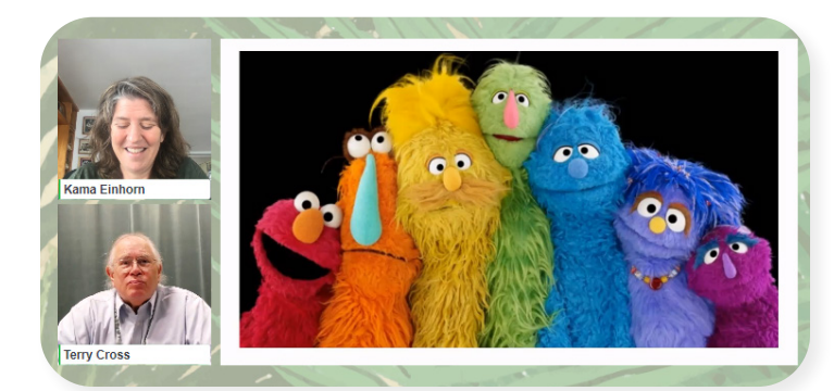
Kama Einhorn, Sesame Street in Communities, at general session